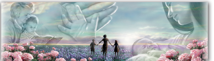
A Father's Touch