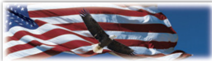
Flag with Eagle