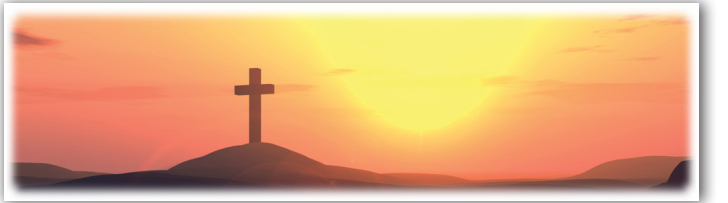
Forever in God's Care