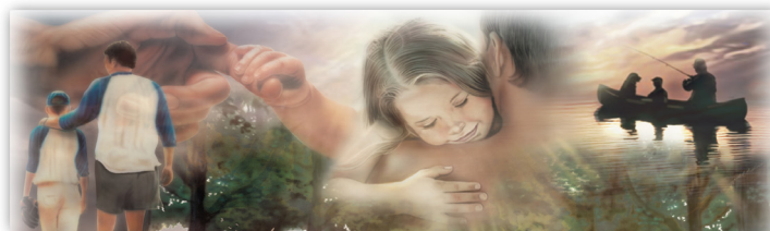
A Mother's Love