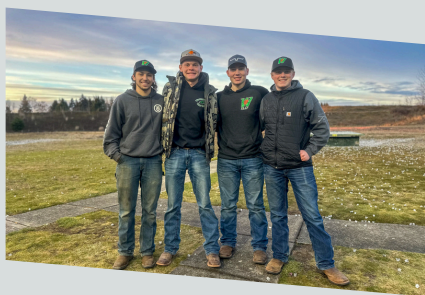
FOUNDERS OF THE WOODLAND TRAP SHOOT FCA HUDDLE