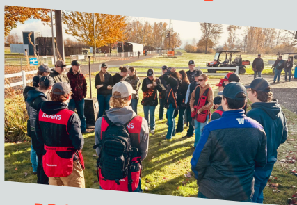
PRAYER HUDDLE AT A TOURNAMENT