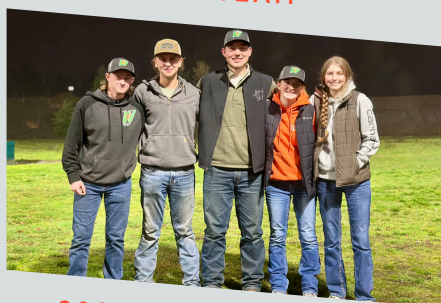
18 2025 SALT LEADERS

The Woodland Youth Sports Clay Target Team started our FCA huddle last year and we're so excited for the ways that God continues to work through and impact our students and the team. Each week, our four team leaders facilitate a huddle before practice. We've watched this student-group grow from just a handful of students to include a majority of our team, often close to 20 of our athletes.