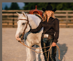
DIVISION ONE ATHLETE UNIVERSITY OF TENNESSEE MARTIN EQUESTRIAN TEAM