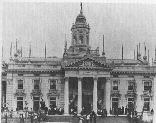
Iowa Building, Louisiana Purchase Exposition, St. Louis Site of 1904 Annual Meeting

She concluded with the hope that the Federation, cooperating with the Commission and ILA, would "see the day when every man, woman and child in Iowa has access to a good public library."