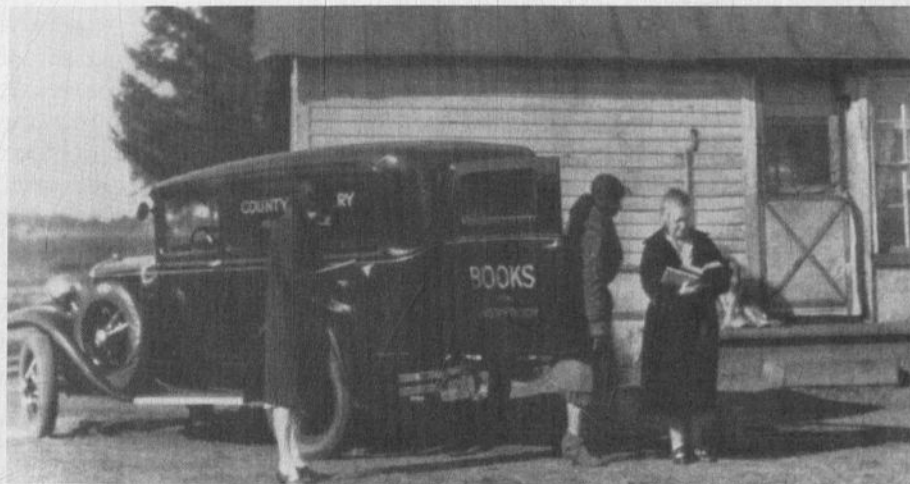
Black Hawk County Book Van visits a farm station, ca. 1931

I know there has been some feeling on the part of a few because we have devoted so much of our time and effort during the past two years to the county library demonstration. To some it has not seemed entirely appropriate for the ILA to expend so much of its revenue and effort on this one project.