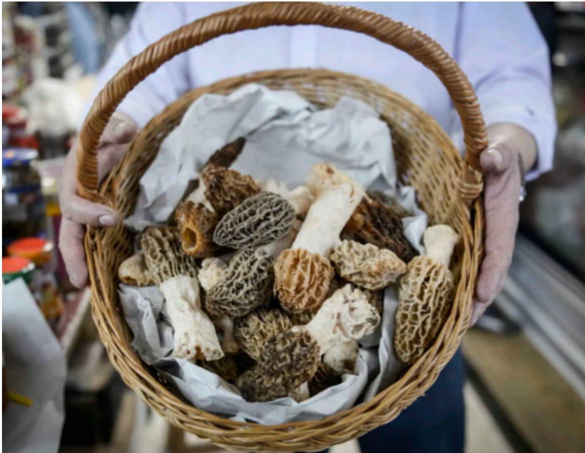
A basket of Morels

And don't forget to be neighborly, a lot of our snowbirds are coming back from the warm climate. It always feels good to be a good neighbor and to be helpful, especially when we all went through this horrendous winter. So walk slowly with purpose into another beautiful and God gifted northern Michigan spring.