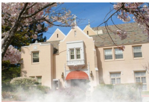
Remembering & Giving Thanks for 44 years of Mercy Center

Let us join members of the Legion of Mary and the six praesidia at Saint Augustine Parish in celebrating the Holy Rosary in the month of October through the daily recitation of the Holy Rosary. Daily recitation at 8:30 am from Monday to Saturday, and Sundays, around 8:15 am in the chapel.