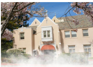
Remembering & Giving Thanks for 44 years of Mercy Center

Let us join members of the Legion of Mary and the six praesidia at Saint Augustine Parish in celebrating the Holy Rosary in the month of October through the daily recitation of the Holy Rosary. Daily recitation at 8:30 am from Monday to Saturday, and Sundays, around 8:15 am in the chapel.