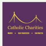
CATHOLIC CHARITIES SAN FRANCISCO Adult Aging Programs and Memory Care