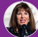
JACKIE SPEIER former Congressmember