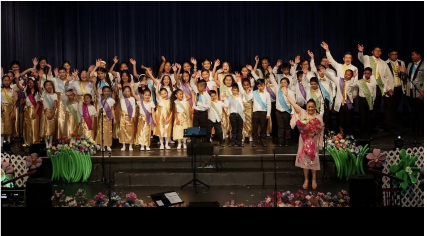
The spectacular concert of the Saint Augustine Children's Choir, "The Sound of Music", held at South San Francisco High School Auditorium on June 7, 2025.