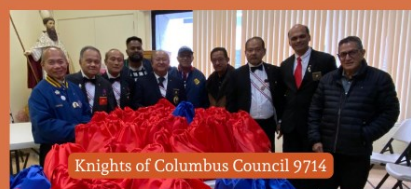
Knights of Columbus Council 9714

Local stewardship invites us to create bridges between parish communities and non-profit organizations that serve the most vulnerable populations.