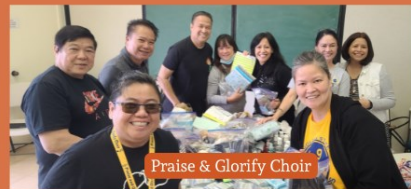
Praise & Glorify Choir