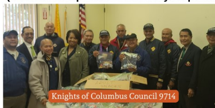
Knights of Columbus Council 9714

By partnering and collaborating with Catholic Charities, Saint Augustine Parish is able to make a difference directly in the lives of the individuals, families, children, adults, and seniors who benefit from their programs.