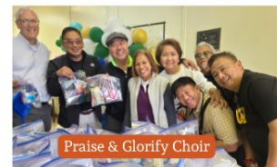
Praise & Glorify Choir