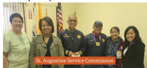
St. Augustine Service Commission