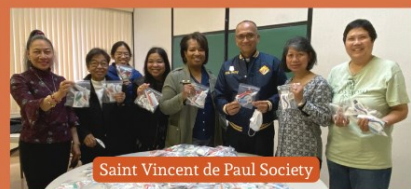
Saint Vincent de Paul Society

(Link to more photos: www.bit.ly/helpthehomelessSept2022 )