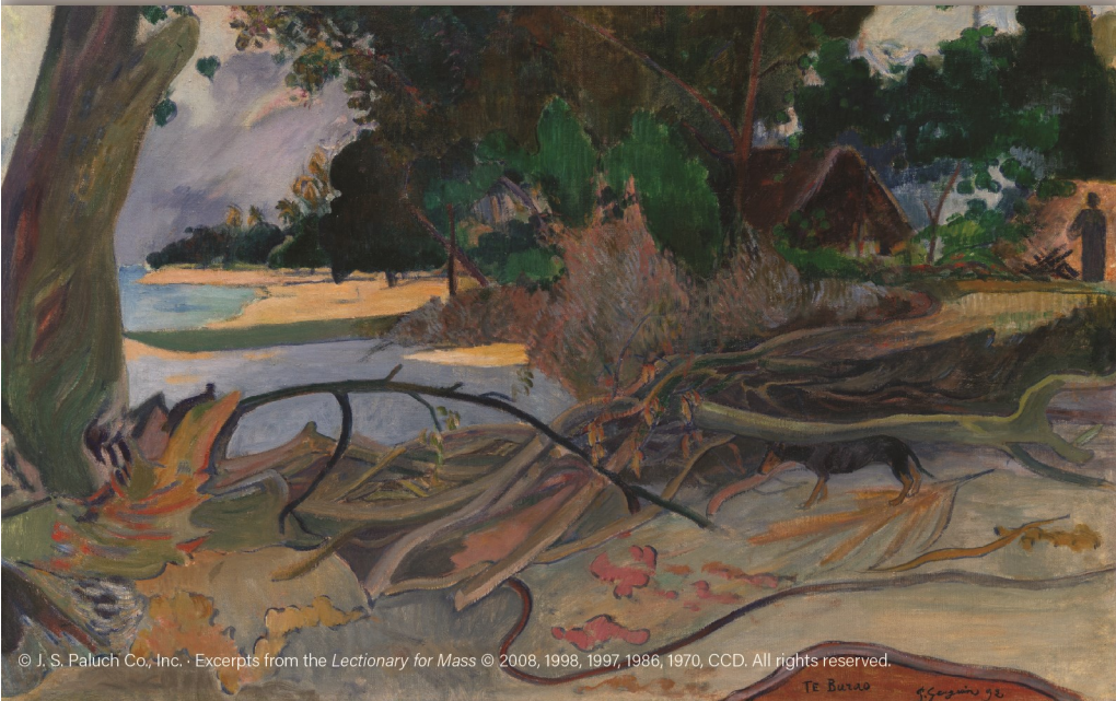
Te burao (The Hibiscus Tree) 1892 Paul Gauguin French, 1848–1903 Art Institute of Chicago

Sixth Sunday in Ordinary Time February 13, 2022