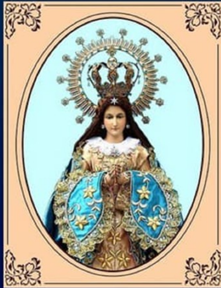
Virgen de los Remedios PATRONESS of PAMPANGA PHILIPPINES