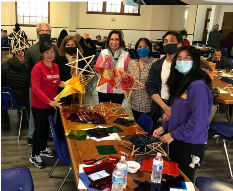
Saint Augustine Church parishioners at the Parol-Making Workshop at St. Monica Church in San Francisco.