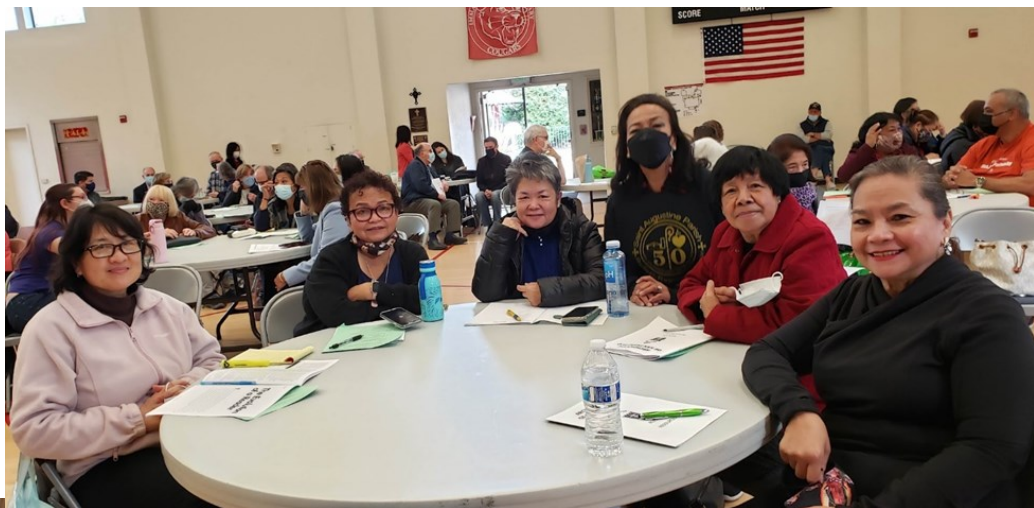
Saint Augustine Church lay ministers who attended the Eucharistic Ministry workshop in Belmont.