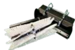
AXI® sweeper brush with collection tray (optional)