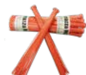
Bundle of synthetic tufts