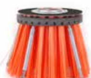
Weedee® weed brush