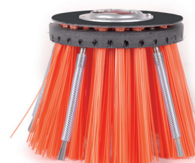
4. Weede® brush Removes weeds and mosses from the surface and the joints