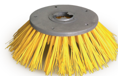
3. Terrazza Sweeper® Sweeping brush for remnants of plants, dirt, etc.