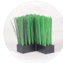
Block brush element®