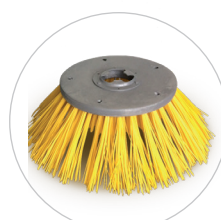
Terrazza Sweeper® brush