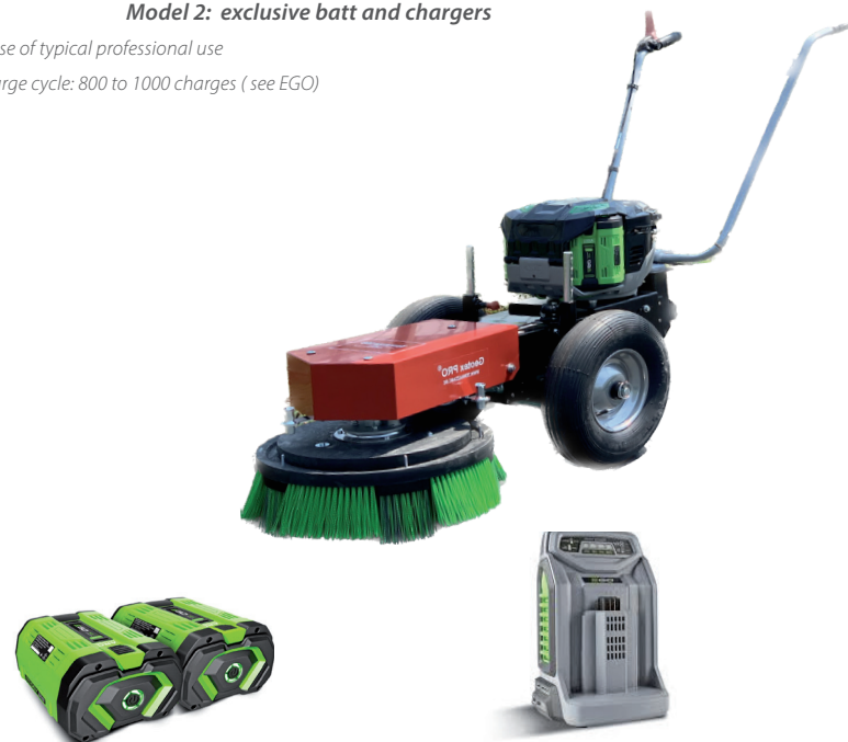
5. Terrazza-EGO Battery pack Batteries - 2 pack 2x 12Ah

(**)Charge cycle: 800 to 1000 charges ( see EGO)