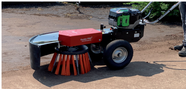
The Weedee® brush