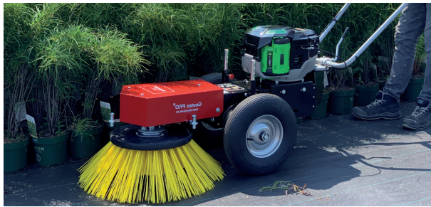
The Sweeper® brush