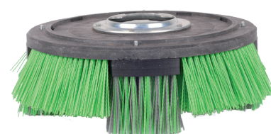
2. Terrazza Geo TECH® Cleaning of geotextile with or without water ( anti-root control fabric)