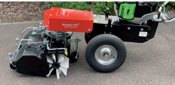
The AXI® roller brush

The easy manoeuvrable Terrazza E-Geotex PRO® brushing machine is the ideal machine for cleaning and removing weeds on all sorts of geotextile (woven and non-woven anti-root control fabric) and the aisles, passages and working area.