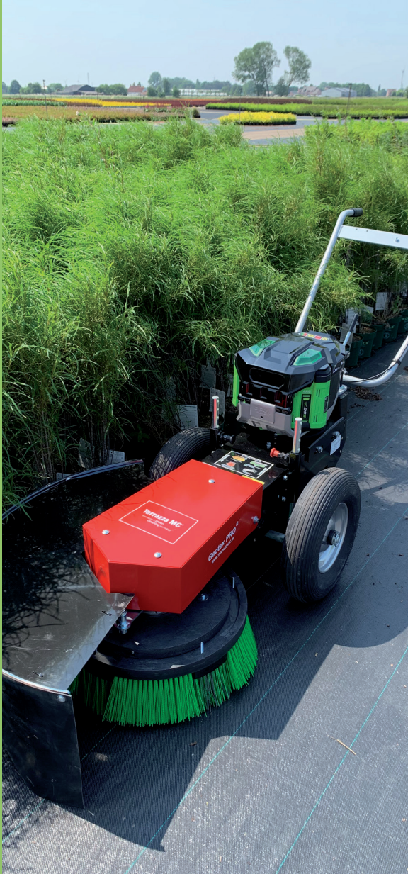
The Geo TECH® brush