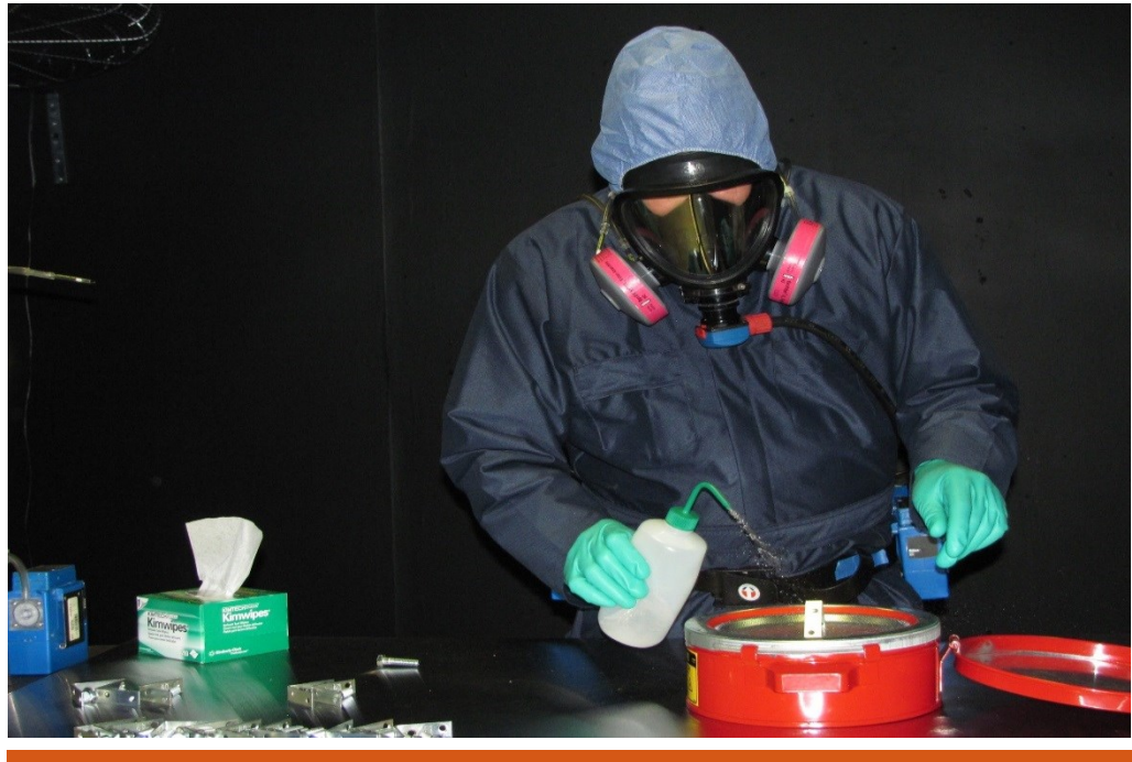
MAS, LLC BOMOPROPANE PARTS CLEANING WORK PRACTICE STUDY