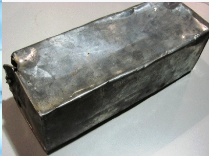
Forensic Metal Testing Weathered Metal Box Analysis