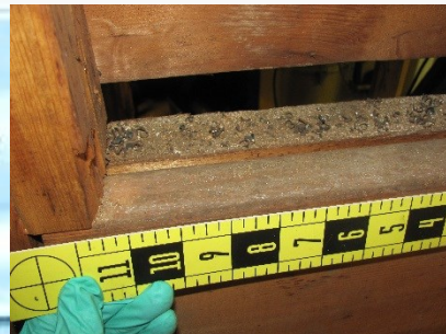
Forensic Dust Testing Contaminated cabinet surface