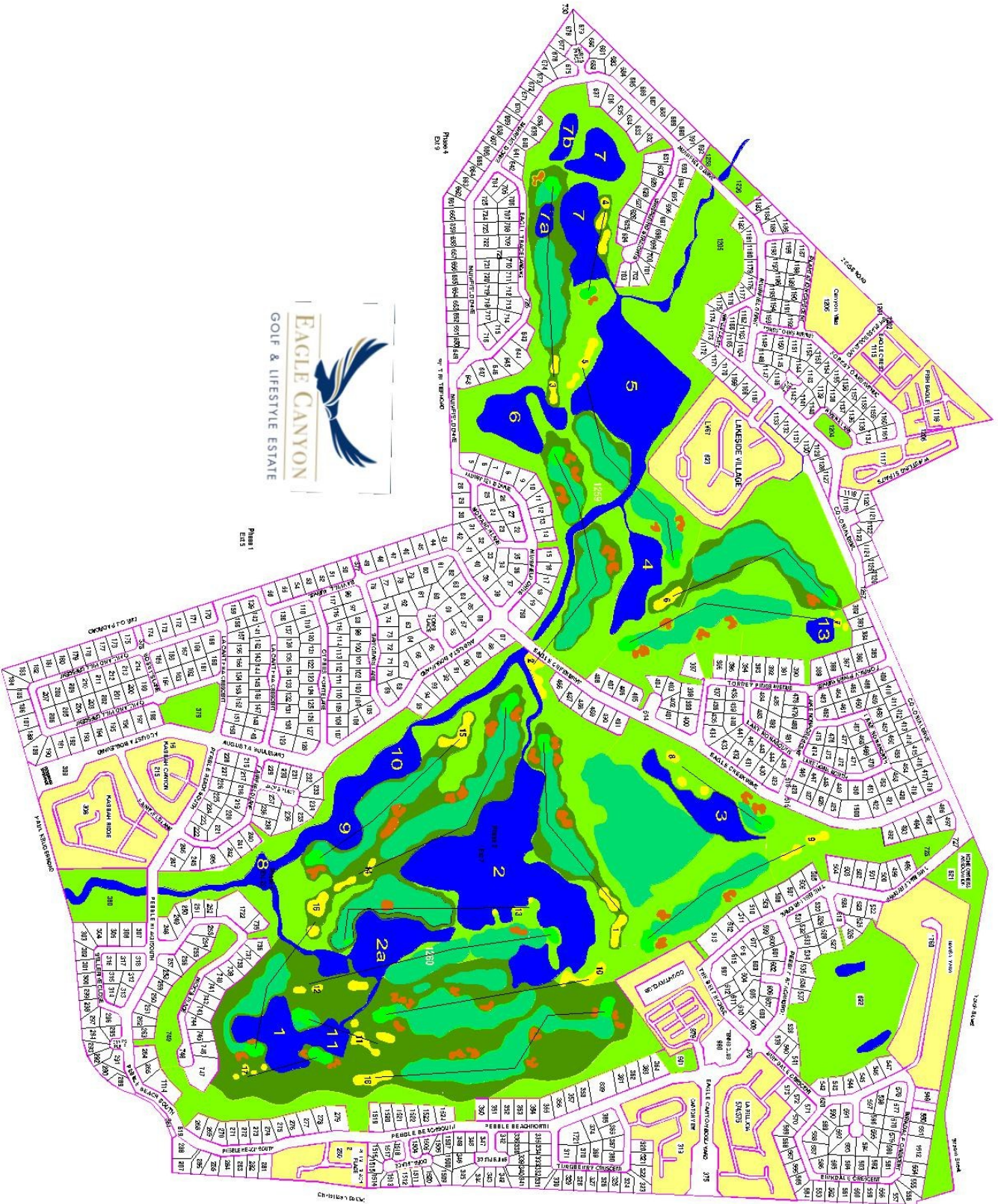
PHASE 4 E019