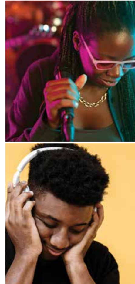
The Power of Music: Perceptual and Behavioral Consequences of Powerful Music , published in Social Psychology and Personality Science.