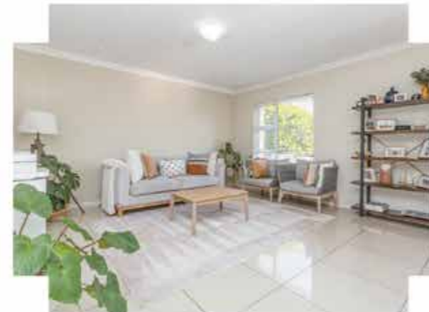
Rented within 3 days of listing