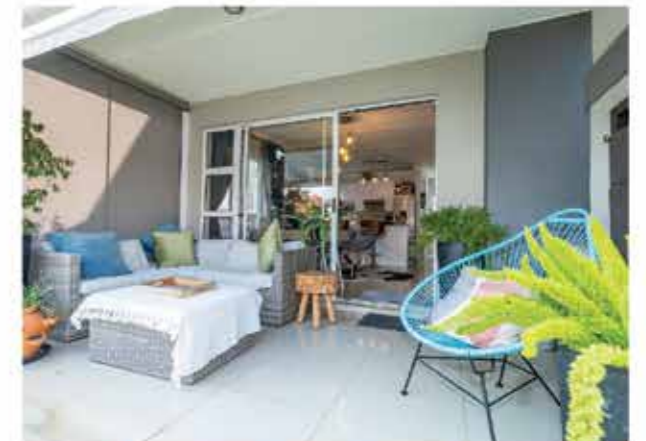
Rented within a day of listing

With more than 25 years of real estate knowledge and experience and 15 years in Eagle Canyon, we understand luxury Estate living and can offer the best value proposition.