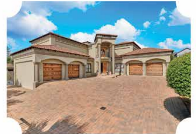
R6,550,000 - SOLD