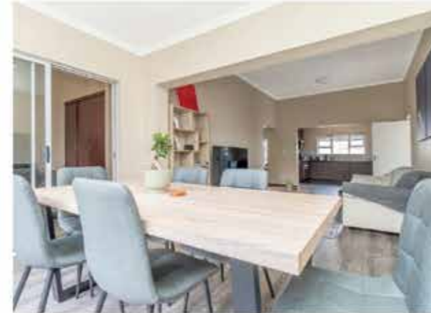
Rented within a day of listing