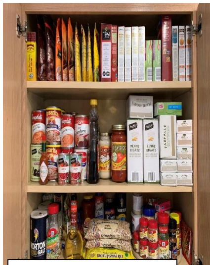
FAM food cupboard

Can you donate some food items to fill the FAM food cupboard? Current needs: spaghetti and spaghetti sauce and items that do not need cooking eg snack bags of almonds, packages of cheese and crackers. Bring your items to the church and place in the wagon in the foyer, all donations welcome. See Sharon Hunter for more information