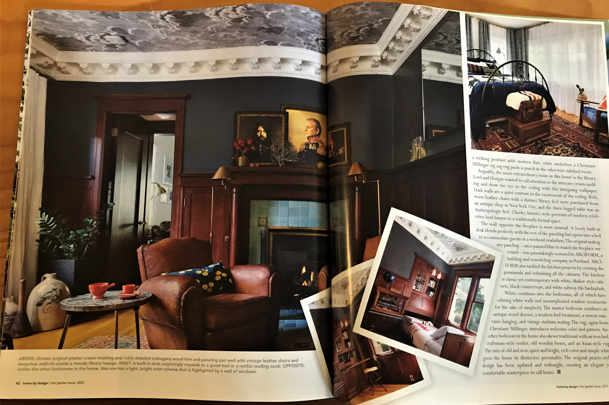
ABOVE: Ornate original plaster crown molding and richly detailed mahogany wood trim and paneling pair well with vintage leather chairs and deep-hue walls to create a moody library lounge. INSET: A built-in desk surprisingly expands to a guest bed or a restful reading nook. OPPOSITE: Unlike the other bedrooms in the home, this one has a light, bright color scheme that is highlighted by a wall of windows.

a striking pendant adds modern flair, while underfoot a Christiane Millinger zig-zag rug packs a punch in the otherwise subdued room. Arguably, the most extraordinary room in this house is the library. Lord and Hodgkin wanted to call attention to the intricate crown molding and draw the eye to the ceiling with this intriguing wallpaper. Dark walls are a quiet contrast to the excitement of the ceiling. Rich, worn leather chairs with a distinct library feel were purchased from an antique shop in New York City, and the three-legged table was an Anthropologie find. Cheeky, historic-style portraits of modern celebrities lend humor to a traditionally formal space.