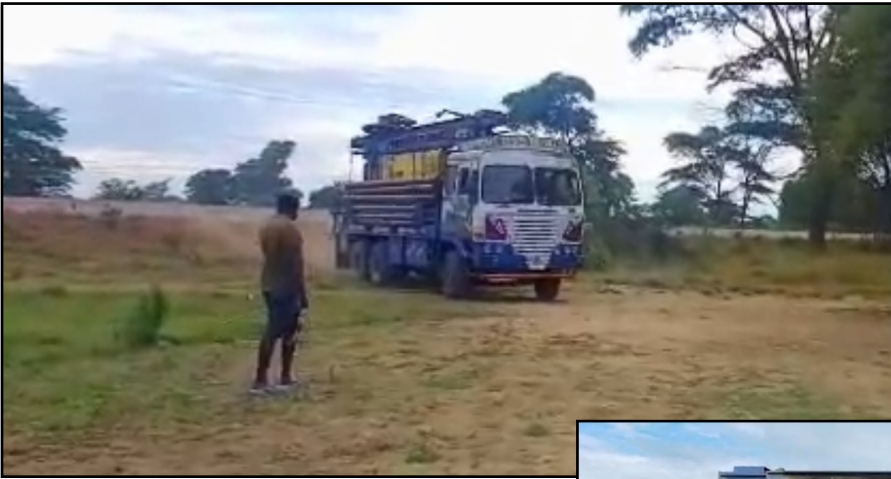
Arrival of the drill truck and supplies