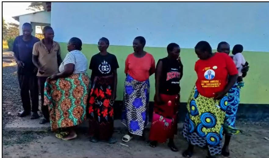
Engagement and consultation with the community