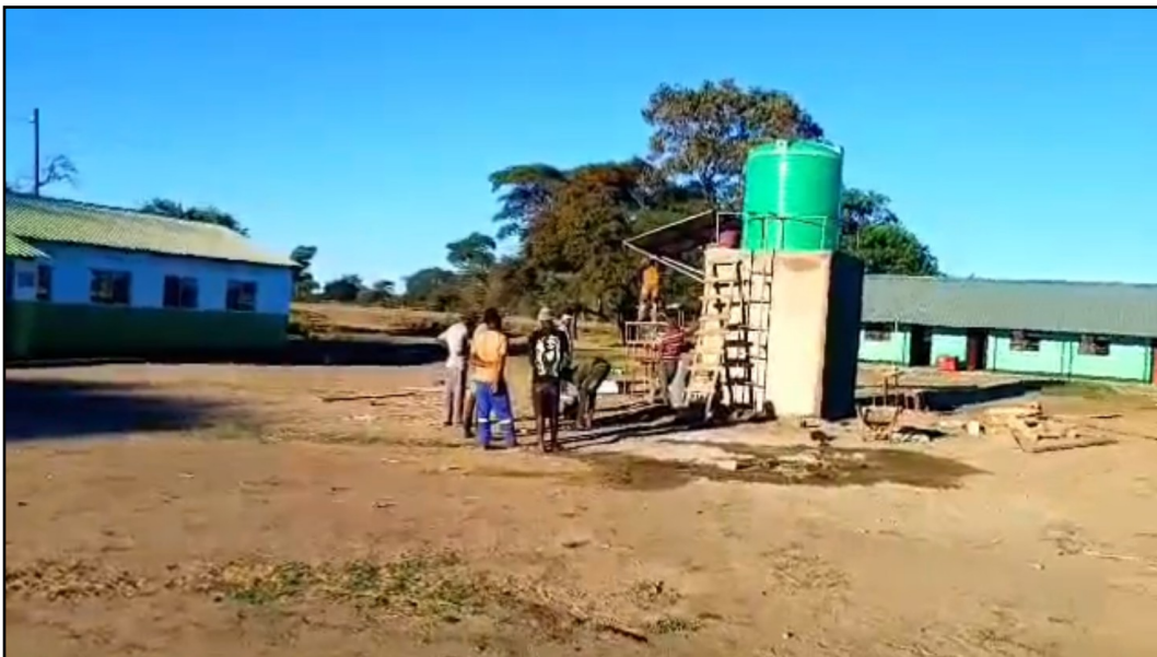
Solar panel being installed