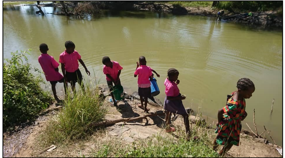
Children gathering water for school before the borehole project was complete