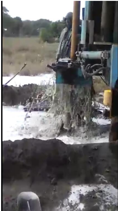
Drilling rig hitting water