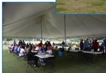
Lots of Fun and Fellowship - #15 was another great year!