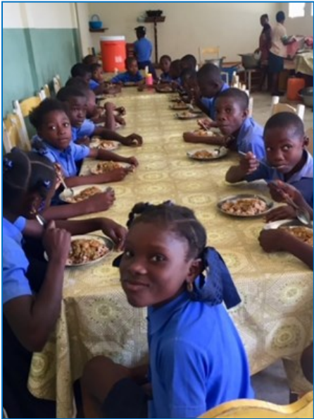
Happy, healthy, smiling faces. It wasn’t always like this. Without your help it would be a much different story.