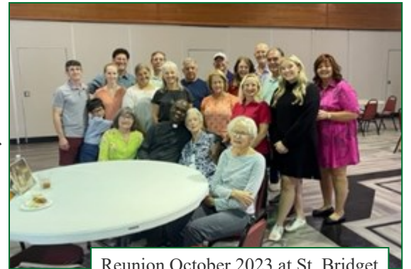
Reunion October 2023 at St. Bridget