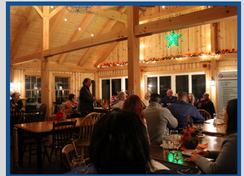
“Thank You, Trumbull!” | November 19, 2025