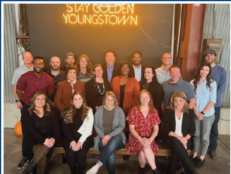
"Thank You, Mahoning!" | October 12, 2022