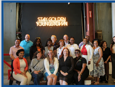
“Thank You, Youngstown!” | July 31, 2025