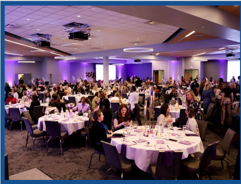
Women's LeadHERship Summit | March 20, 2025

“These events are more than just gatherings; they are strategic touchpoints for connection and growth. The exceptional engagement seen this year underscores the vital importance of creating intentional spaces where our community of entrepreneurs can collaborate and flourish.”