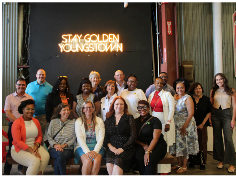
"Thank You, Youngstown!" | July 31, 2025

As a way of saying thank you to our valued partners, clients, and community champions in the City of Youngstown, Warren, Trumbull and Mahoning Counties, we hosted a series of special evenings dedicated to celebrating the incredible impact we've made together--thanks to each partner's support and belief in our mission. Each program included light refreshments, networking, and a brief program highlighting the powerful results of our collaboration.