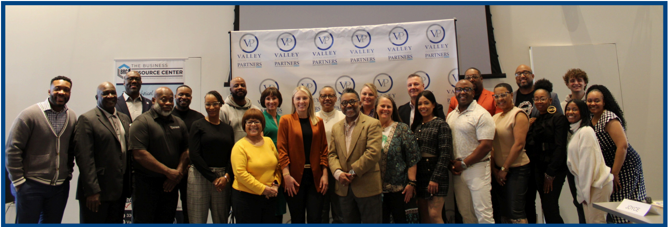
Cohort 5 Graduates | February 18, 2025 - March 25, 2025

Business owners participated in VP's 6-week Business Accounting & Legal Assistance Grant program in order to obtain $8,000 in grant scholarships for accounting & legal services. The grant was given upon completion of the program, which included attendance of all six classes [one class a week for six weeks] and a completed business plan. Each participant also walked out of the program with a better understanding of business plan development, legal & insurance principles, strong marketing, tax returns, and financial statements.