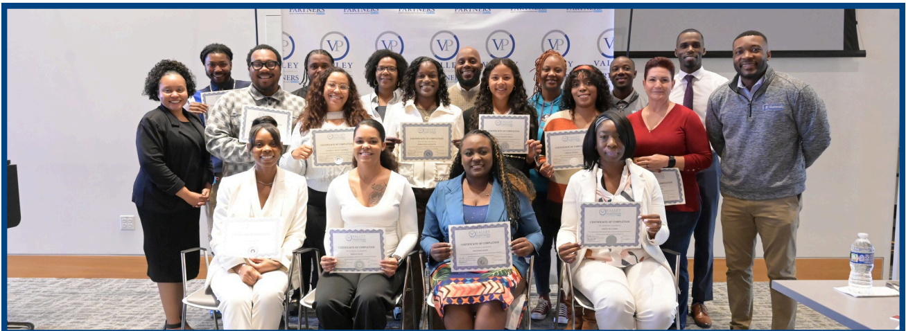
Cohort 6 Graduates | September 9, 2025 - October 14, 2025