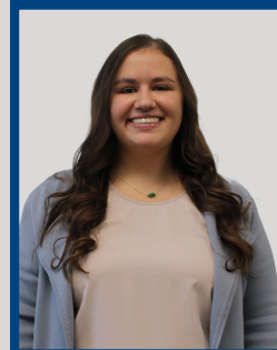
Madison Southern Loan Officer