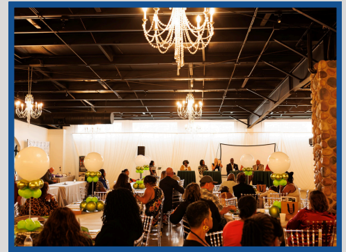
Seeds for Growth | August 20, 2025