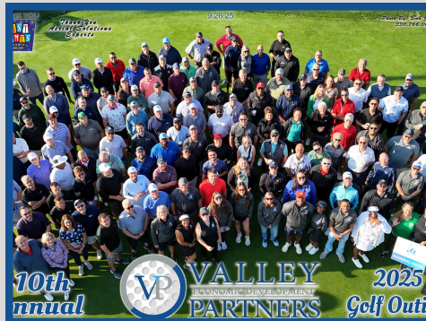
10th Annual Golf Outing | September 26, 2025