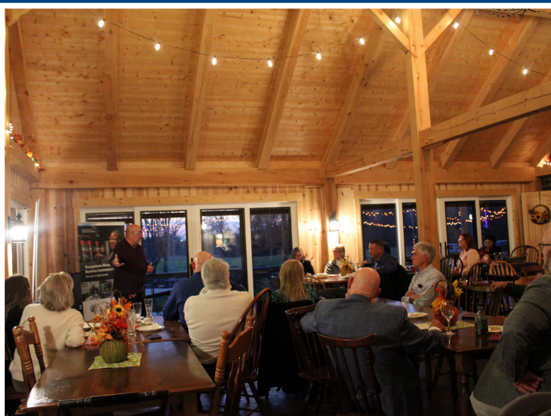
"Thank You, Trumbull!" | November 19, 2025