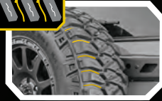
STONE EJECTOR RIBS