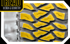
OPTIMIZED TREAD DESIGN & GEOMETRY