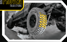
BAJA PROVEN TREAD STYLING