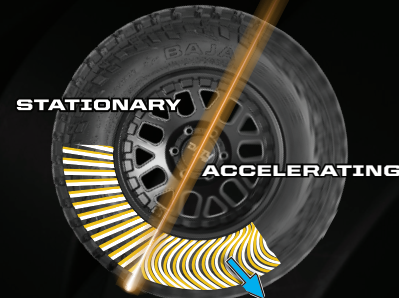
High Torque Twist