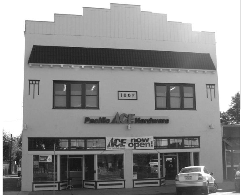
Pictured above: the new ACE Hardware store which is now open in downtown Esparto.

Volume Twelve, Edition 11, November 2010