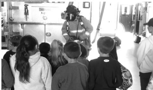
Pictured above and to the right are students participating in the RISE Summer Program in previous years.