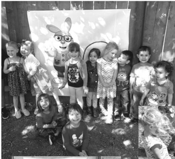
Sundrise Development Center children at play.