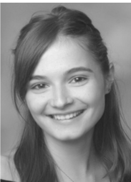
Twelfth Edition, Volume 3, March 2010