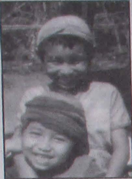
Esparto children ready to learn

Are you an Esparto working parent or guardian who has to travel into Woodland or nearby 'urban' cities for childcare services or who wants their child to acquire preschool experience? If so, you may soon find a solution to your childcare dilemmas.