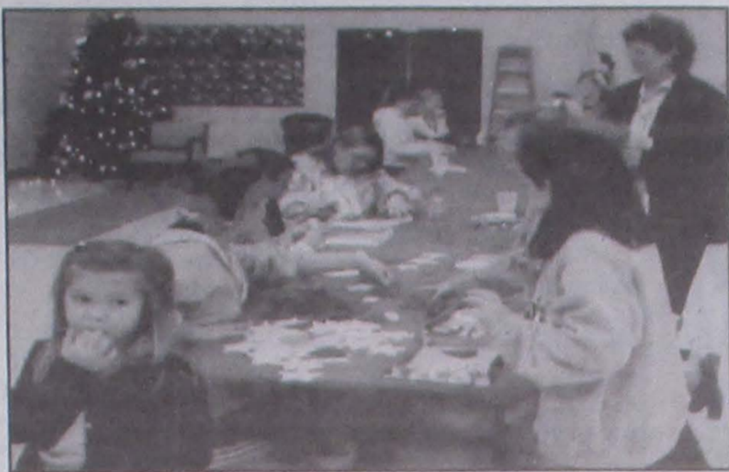
Esparto kids and families participating in the Ornament Festivity

The Ornament Night is intended to be enjoyed by the entire family. Join the fun next year!