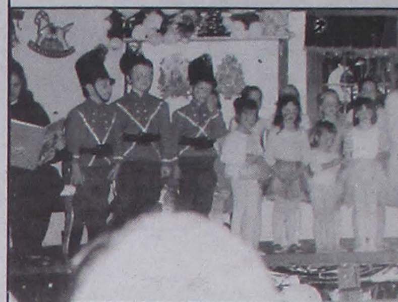
Capay Valley students