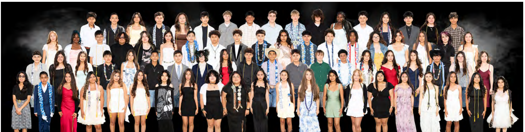
Esparto Middle School 8th Grade Promotion