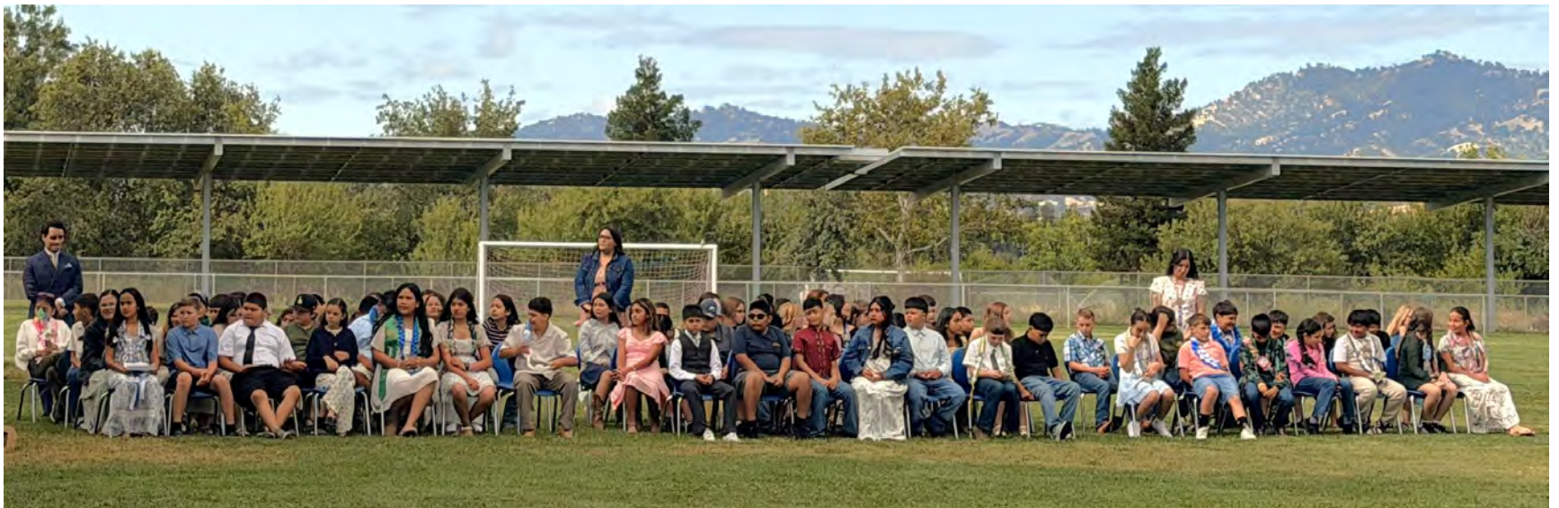
Esparto Elementary 5th grade Promotion

Congratulations and best of luck on your journey ahead!