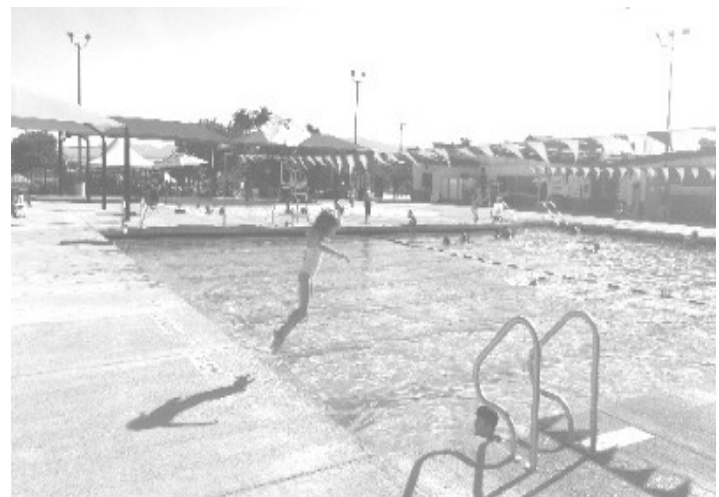
Despite its interruption, the Tule Mem Park swim season brought joy to many!

This event is free to the public and light refreshments will be available. Donations are appreciated, however, to make more programs like this possible. Seating at Norton Hall is limited, so attendees are urged to send an email to woodlandleagueneeds@gmail.com if they plan to attend and the size of their party. More information about the CAAP is available at https://www.yolocaap.org/ . The League of Women Voters is a non-partisan organization dedicated to voter education and empowering citizens to shape better communities worldwide. For information on the Woodland League's climate change position and advocacy activities, please visit https://my.lwv.org/california/woodland/recent-issues/climate-change .