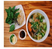
31. Vegetarian Pho

Mushrooms, carrots, Chinese cabbage & broccoli