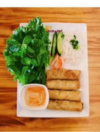
1. Spring Roll (4 Rolls)

Prawns, vermicelli & vegetables rolled in fresh rice paper. Served with peanut dipping sauce.