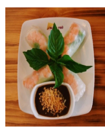
3. Summer Rolls