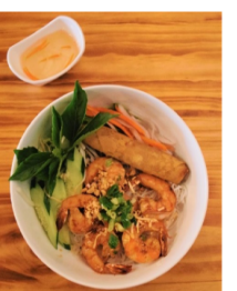
35. Grilled Shrimp & Spring Roll Vermicelli Bowl