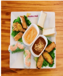
10. Mama Sampler Platter