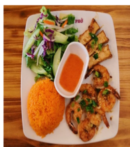
16. Grilled Shrimp & Tofu Rice Plate