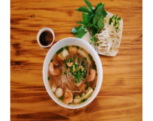
33. Seafood Pho