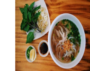
29. Chicken Pho