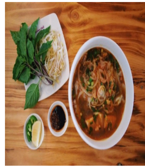
42. Vermicelli & Spicy Beef Soup

Spicy soup with thick vermicelli noodles served with brisket, flank steak & tofu decorated with round onions & green onions.