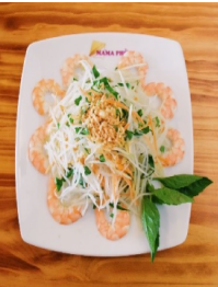
6. Green Papaya Salad

Beef ceviche served with lettuce, onions, cucumbers & pickled vegetables tossed in house special sauce, topped with peanuts & fried onions.