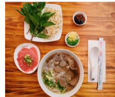
17. Mama's Special Pho