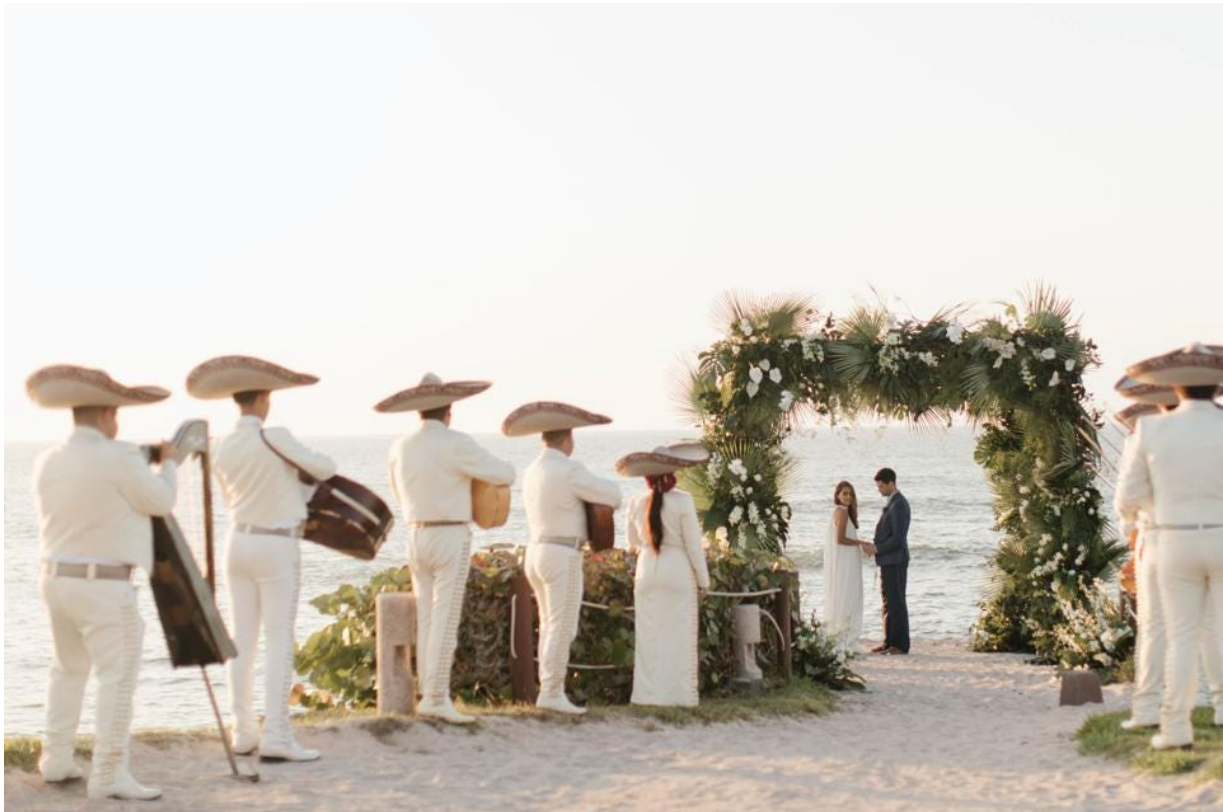
Enjoy a traditional Mexican ceremony. FOUR SEASONS PUNTA MITA

Four Seasons Resort Punta Mita in Riviera Nayarit, Mexico, created the Once Upon A Time in Punta Mita to offer couples the chance to weave the beauty of the Mexican culture into a vow renewal ceremony. When guests choose this package, the resort team will help create the perfect Punta Mita wedding, including a traditional Lasso Ceremony. In addition, the package includes round-trip airport transportation, one experience (couples massage, dinner under the stars, turtle release, or tequila blending), a complimentary bottle of tequila, a personal photographer for up to four hours, traditional