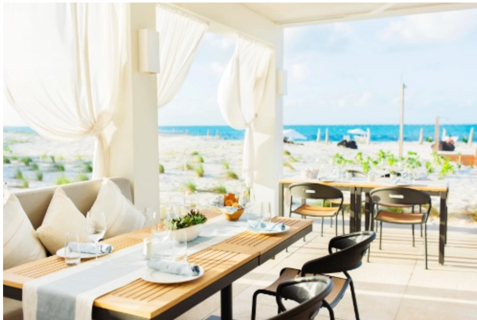
Zest Restaurant at Wymara Resort & Villas