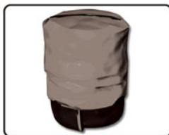
Step 6: Place the game into a Game Bag or Game Wrap.