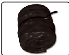
Step 5: Use a game strap to secure the roll.