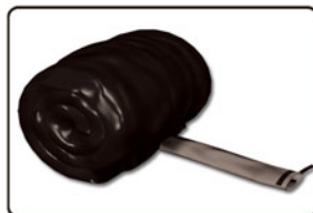
Step 4: Roll the game into a roll by starting at the front and working back towards the inflation tube.