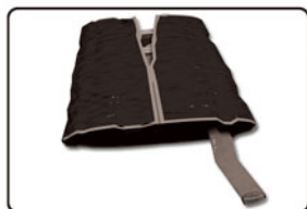
Step 2: Fold the game in 3rd's by folding one side in.