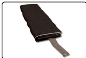
Step 3: Fold in the other side.