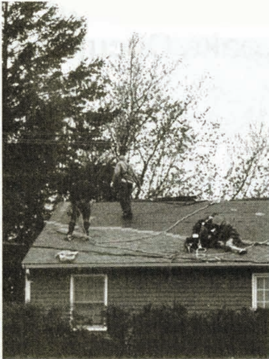
All of Wooster Roofing's workers wore safety harnesses during the job.

Riney Management and Royal Management Company. After talking with all of Wooster Roofing's recent customers, Cross Point awarded the job to Wooster Roofing based on its recommendations, previous projects in the area and its commitment to quality and workplace safety.