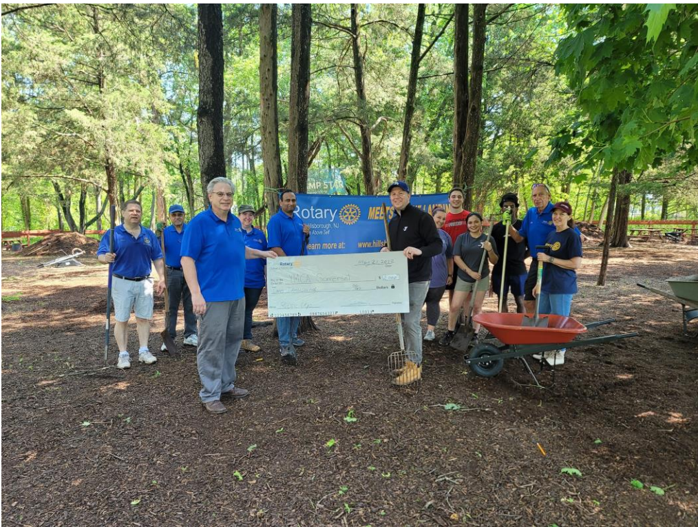
Hillsborough Rotary assists with the clean-up of HY summer camp and a donation of $2,000!