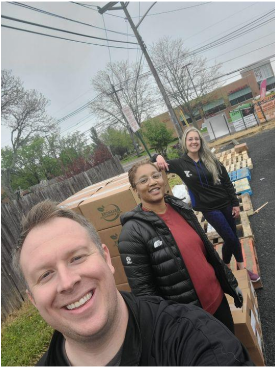
Franklin Food Distribution. 100 families receiving 2 boxes of produce each month. The Y is here to support the Franklin Food Bank in this initiative.