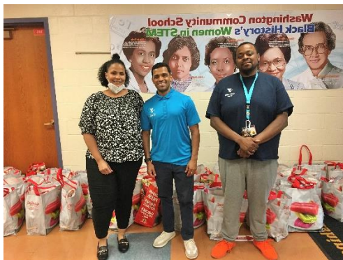
Food Deliveries - Washington School