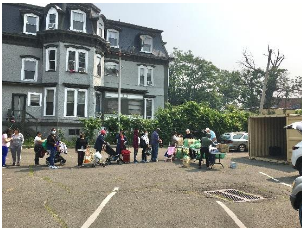
June Food Distribution