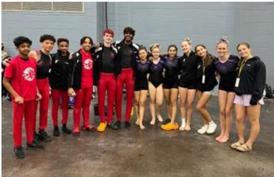
Diamond and Bronze Girls and Boys team

The 2023 Y Gymnastics Nationals were held in Cincinnati Ohio at the Duke Energy Convention Center.