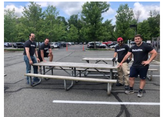
Deloitte IMPACT Day