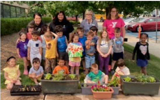
Learning About Plants with the "Green Team"