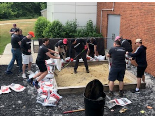
Deloitte IMPACT Day