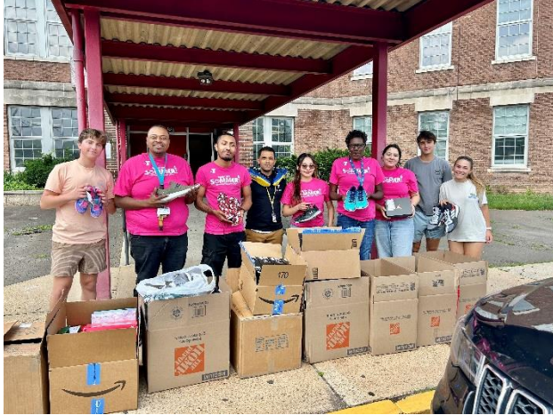
Getz Movin Sneaker Donation