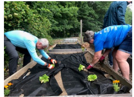
Rotary Club and Planting of the Giving Garden