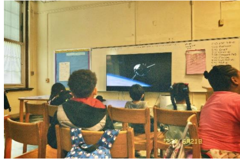
Juneteenth Celebrations - Movie Night – “Hidden Figures”