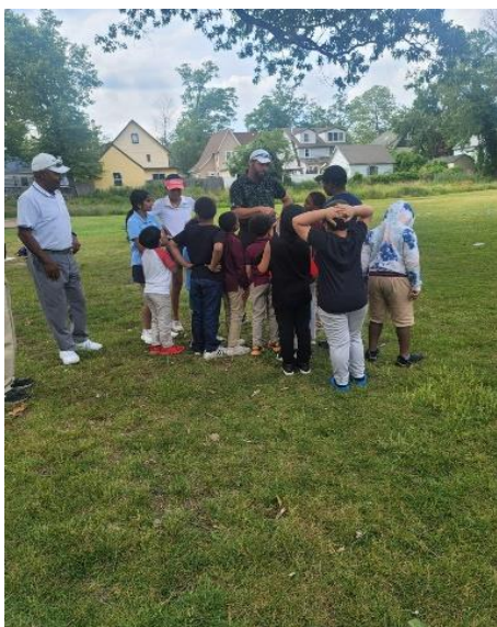
First Tee Session at Cook