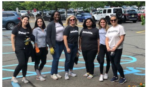
Deloitte IMPACT Day