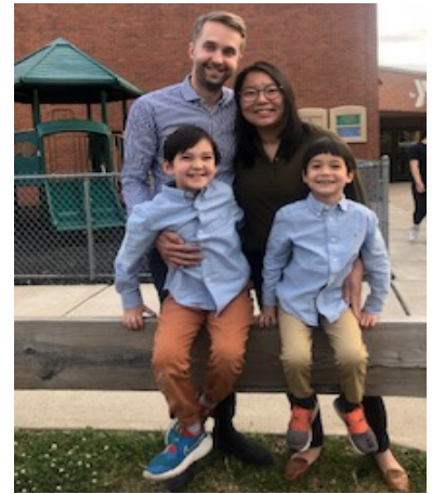
Preschool II Graduation and Family Fun/FAMJAM