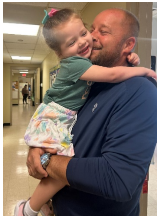
Father's Day Breakfast