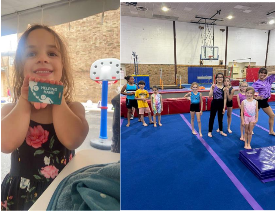
Pics from Camp Timber: