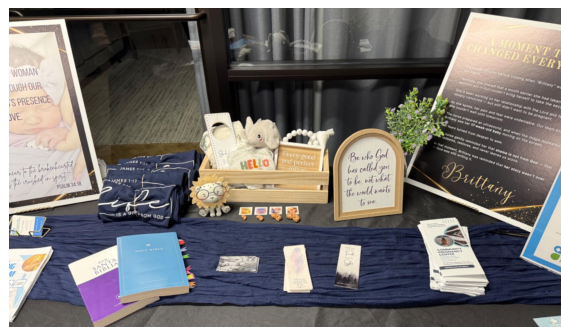
Jewel Conference by At His Feet Ministry