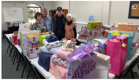
Zion Lutheran Church hosted a baby shower