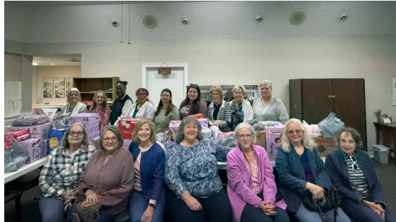
Women's Ministry Baby Item Drive