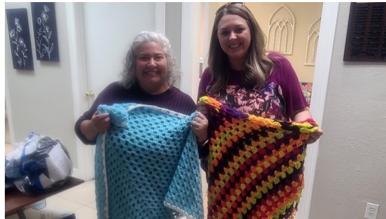
Blanket Ministry - St. Bernadette's & Sowing Seeds of Kindness