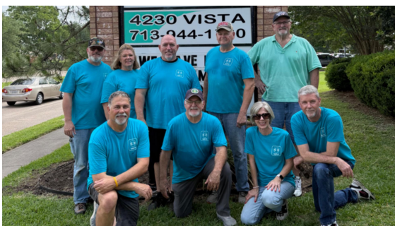
First Baptist Church Pasadena Work Day