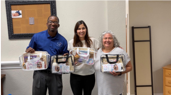
Angel Babies delivering miscarriage bags