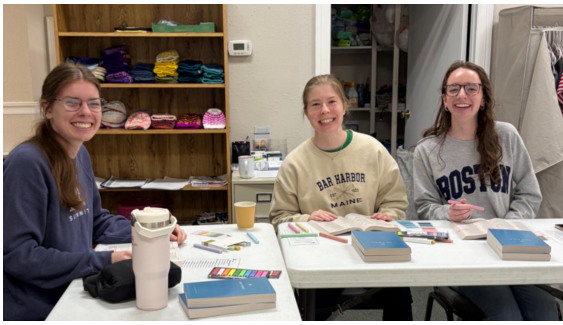
Houston First Baptist Small Group Project