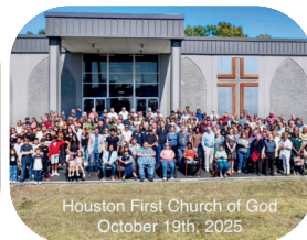
Houston First Church of God October 19th, 2025