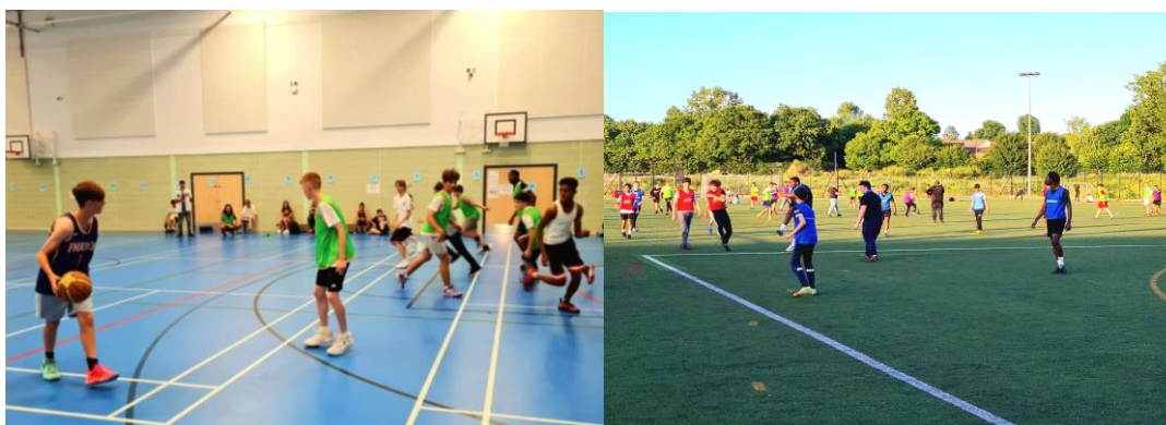
(Photo: from the Left, Basketball and Football sessions at Friday Night Project 24 th June 2022)

The Borehamwood Friday Night Project was launched on 22 nd April 2022 at the Hertswood Academy. The aim was to engage young people from ages 11 to 19 in a variety of free sports activities to ensure they were spending their Friday nights doing something positive and organised, which would also help reduce anti-social behavior in the Cowley Hill Ward, which is one of the most socially deprived areas of Hertfordshire. This is a partnership project with Sporting Inspirations CIC, School of Hard Knocks, Hertswood Academy, Clarion Housing and Herts Sports Partnership. Sporting Inspirations CIC and School of Hard Knocks have been supplying key staff and the Hertswood Academy providing in kind match funding, supported by funding from Clarion Housing and Herts Sports Partnership.