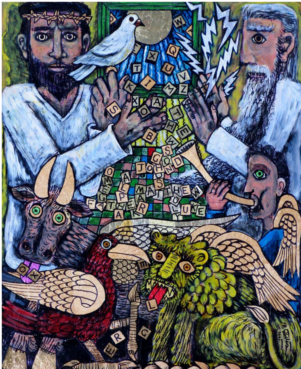
In the Beginning 2003, Whelan, Brian

As the procession enters and the lights flash, please stand as you are able.