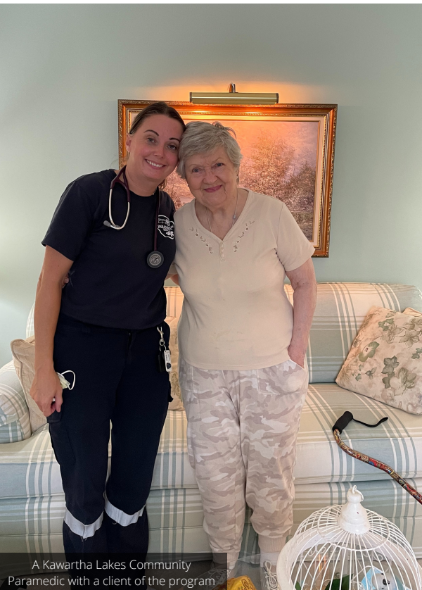
A Kawartha Lakes Community Paramedic with a client of the program

The Community Paramedics also play a vital role in offering the Remote Patient Monitoring Program. This program enlists their expertise to provide health education as well as offering easy-to-use devices to monitor a patient's health from the comfort of their home. A few of the patients of the program have shared their thoughts on using the devices and how this has helped them monitor their health at home. Read our update on the Remote Patient Monitoring Program to see their stories.