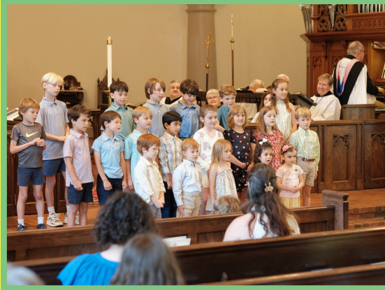
Children's Chapel Choir