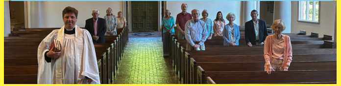
8 am Congregation