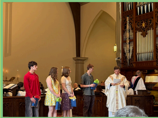
Senior Recognition Sunday