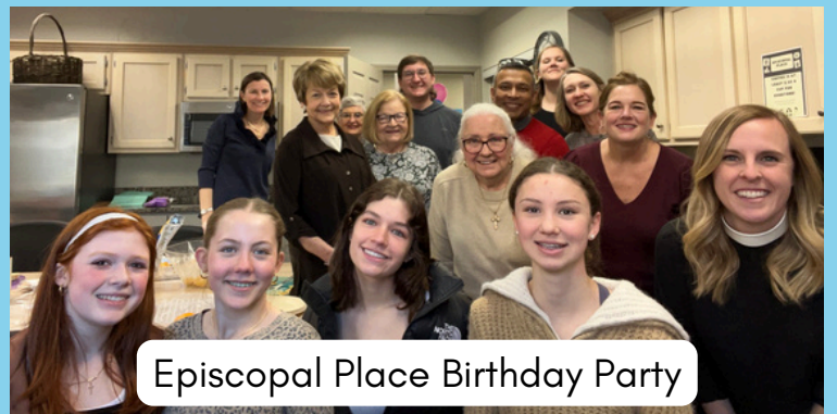
Episcopal Place Birthday Party