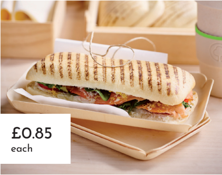
Pre-Grilled Pre-Sliced Ciabatta Vegan

Rustic looking white half-baguette made of wheat flour and a hint of barley malt. The cross incision and generous flour dusting result in a beautiful, characterful expression. La Lorraine Ninove NV. 🍞 PBAPAN022 45 x 125g £0.42 £18.62