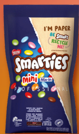
SMARTIES® MINI MIX-IN 500g

Nestlé Professional can help deliver excitement and innovation through quality dessert solutions for menus. Our sauces, spreads and mix ins can be used in a variety of dessert applications.