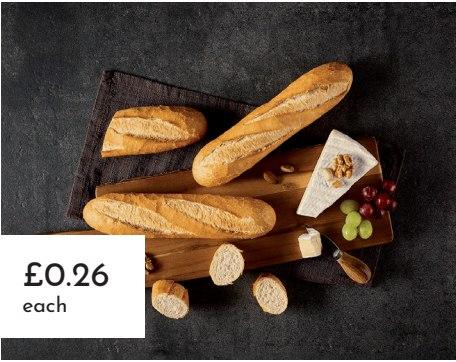
Premium Demi Baguette (White) Vegan

A versatile half baguette made from only natural ingredients: wheat flour, partly whole wheat meal, water, yeast and salt. La Lorraine Ninove NV. 🍞 PBAPAN007 45 x 125g £0.40 £17.79