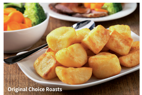
Original Choice Roasts