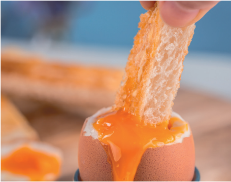
Kingsmill Soft White 800gm Vegan

An ideal sandwich ciabatta. La Lorraine Ninove NV. 🍞 PBAPAN013 40 x 140g £0.49 £19.38