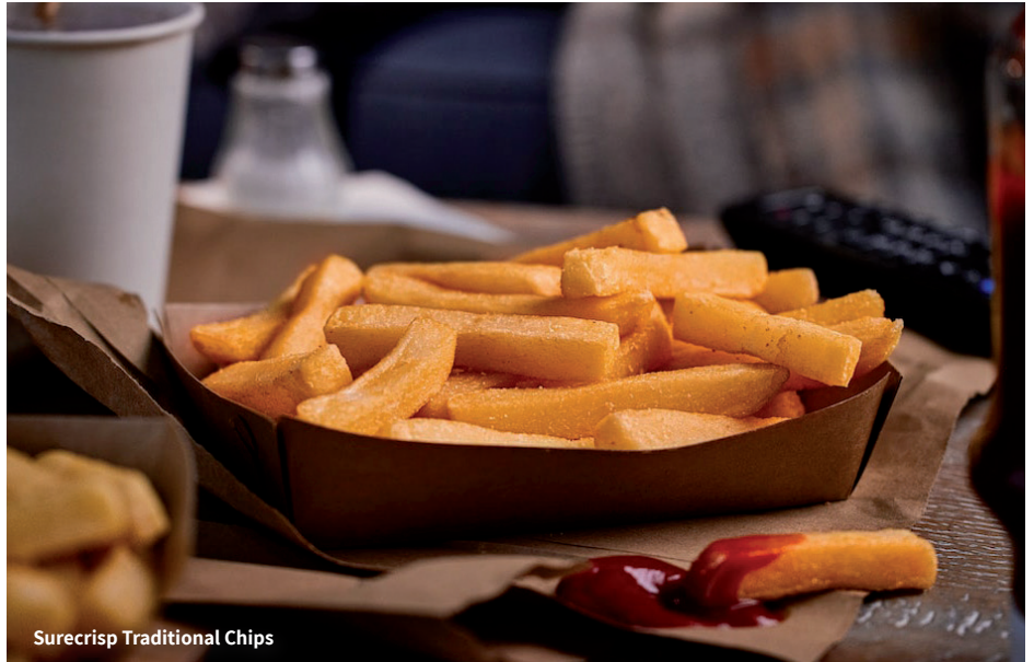
Surecrisp Traditional Chips