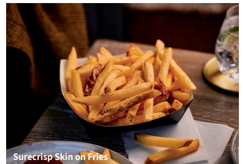
Surecrisp Skin on Fries