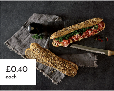
Premium Paysan Baguette (Brown) Vegan

This Spanish baguette successfully combines a thin crispy crust with a light open crumb structure, baked on stone and flour dusted. La Lorraine Ninove NV. 🍞 PBAPAN012 50 x 125g £0.40 £19.77