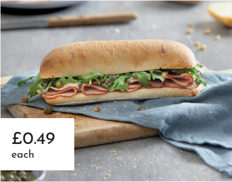
Bocata (Ciabatta) Vegan

Fully baked (thaw and serve) pre-grilled ciabatta (bar marked) and pre-sliced, ready to fill. La Lorraine Ninove NV. 🍞 PBAPAN035 36 x 120g £0.85 £30.29