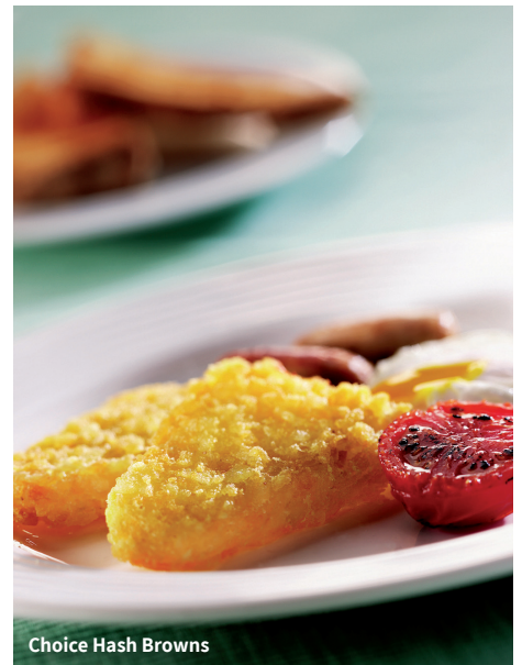
Choice Hash Browns