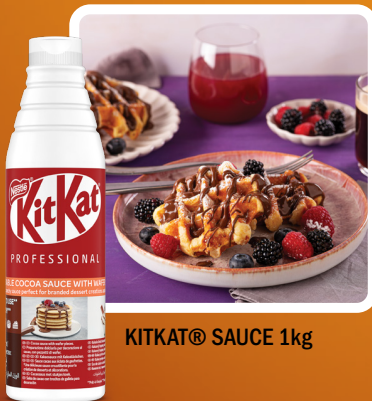
KITKAT® SAUCE 1kg