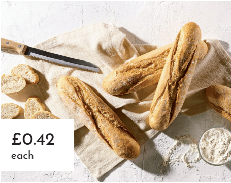
Rustic Cross Demi Baguette White

Rustic looking multigrain half-baguette made of wheat flour and barley malt, enriched with linseeds and sunflower seeds. The cross incision and generous flour dusting result in a beautiful, characterful expression. La Lorraine Ninove NV. 🍞 PBAPAN023 45 x 125g £0.43 £19.26