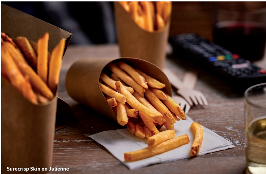
Surecrisp Skin on Julienne