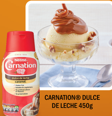
CARNATION® DULCE DE LECHE 450g