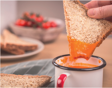
Kingsmill Wholemeal 800gm Vegan

White Medium Sliced Bread. Allied Bakeries - 22121. 🍞 PBAALL002 8 x 1 loaf £12.39