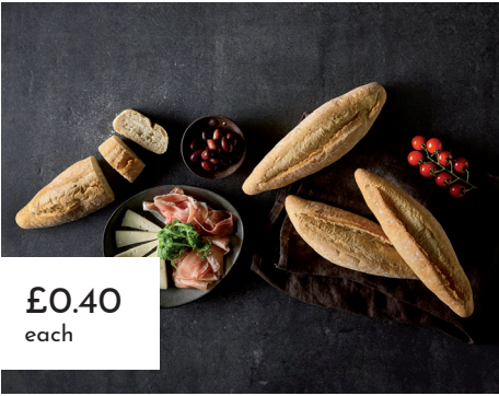
Barra Gallega Half Baguette Vegan

This Spanish baguette successfully combines a thin crispy crust with a light open crumb structure, baked on stone and flour dusted. La Lorraine Ninove NV. 🍞 PBAPAN012 50 x 125g £0.40 £19.77