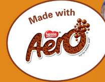
AERO® MIX-IN 500g