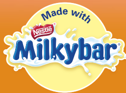
MILKYBAR® MIX-IN 400g