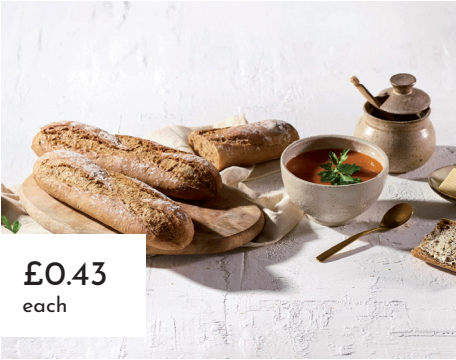
Rustic Cross Demi Baguette Multigrain

A versatile baguette made from only natural ingredients: wheat flour, water, yeast and salt. La Lorraine Ninove NV. 🍞 PBAPAN006 45 x 125g £0.26 £11.47