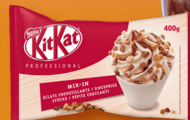
KITKAT® MIX-IN 400g