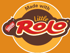
ROLO® MINI MIX-IN 400g

OVER 75% OF CONSUMERS FIND THE IDEA OF A BRANDED TREAT APPEALING*